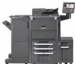
Shown with standard 270 sheet DSDP, optional 3,000 sheet side LCT and 4,000 sheet finisher