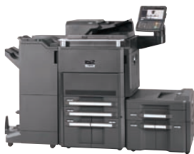
Shown with standard 270 sheet DSDP, optional 1,500 x 2 sheet trays, 500 sheet multi-purpose tray and 4,000 sheet finisher