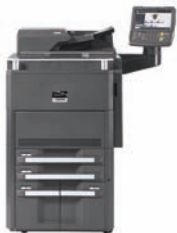
Shown with standard 270 sheet DSDP