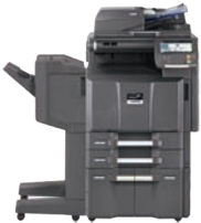
Shown with optional 175 sheet DSDP, optional 1,500 x 2 sheet trays, and 1,000 sheet finisher