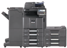
Shown with optional 175 sheet DSDP, 2 - 500 x 2 sheet paper trays, 500 sheet multi-purpose tray, and 4,000 sheet finisher