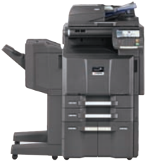
Shown with optional 175 sheet DSDP, 1,500 x 2 sheet paper trays and 1,000 sheet finisher