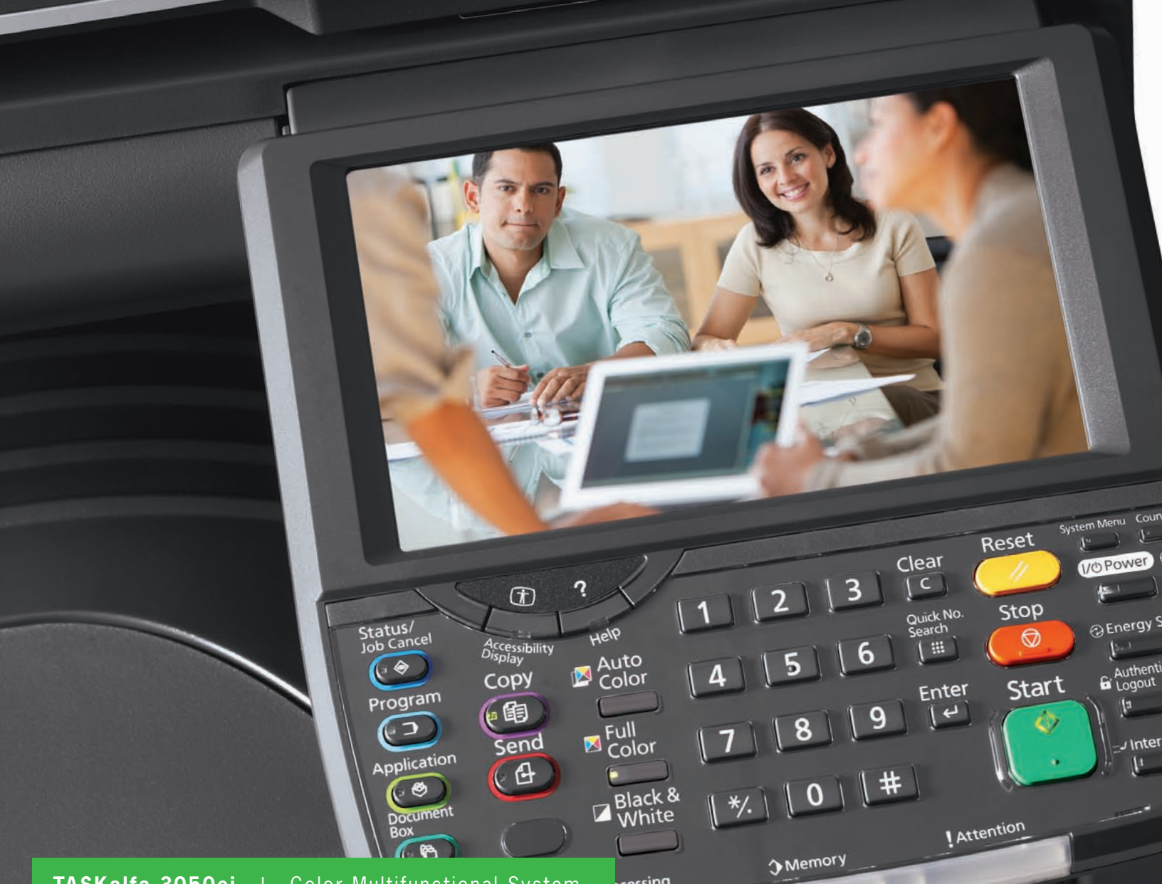
TASKalfa 3050ci | Color Multifunctional System

Powering Color Performance... Company-wide.