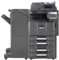
Shown with optional 175 sheet DSDP, 500 x 2 sheet paper trays and 4,000 sheet finisher