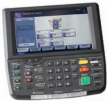
Newly designed, easy-to-use large color touch screen control panel